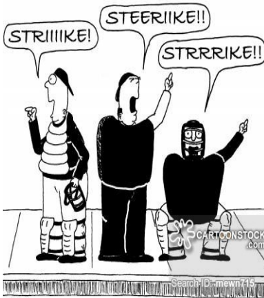
A picket line for the umpires union.